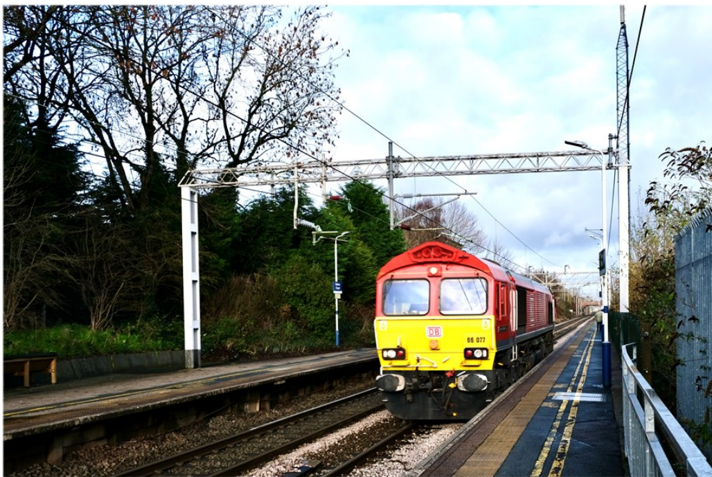
12th December 2020. Holmes Chapel Railway Station.

It is a Deutsche Bahn Cargo diesel-electric locomotive. I understand that it was delivered to the UK at the end of February 1999 via the Newport Docks This class of freight train engine is a common workhorse across Europe.