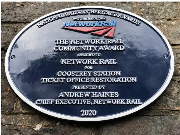
National Railway Heritage Award celebrating the restoration of the remaining ticket office

Debbie and Sian explained their vision in this way: "We hope to build an exciting creative space where we can not only house our working studios but also hold workshops, exhibitions and educational activities. Once we are able to enter, there will be a bit of work to do on the space before we can let the public inside. But we are already planning ideas and we are hopeful that the facility can be a real benefit to local people, including children at our primary school.