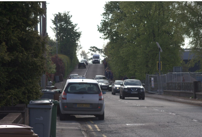
And on the other side its even worse!