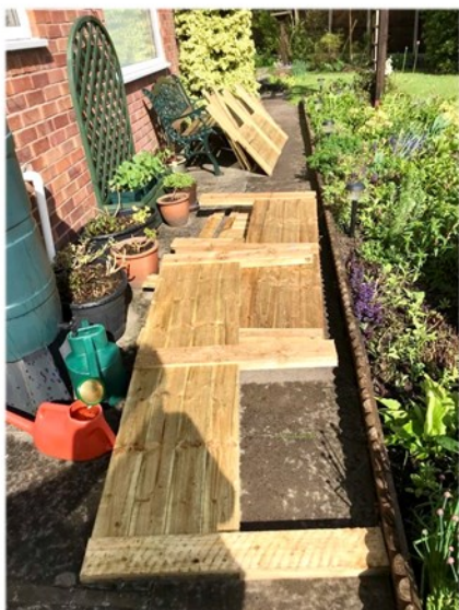
As delivered & transported

At the time of writing Lindsay has documented the construction and installation of the first planter but by the time you read this I hope we have been able to provide the second of the three!