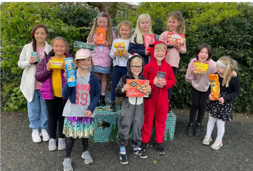
Pupils from Holmes Chapel Primary School celebrating Make the Rules Day and their Rainbow Hamper donations.

To buy a Rainbow Hamper raffle ticket visit: http://bit.ly/PTARainbow