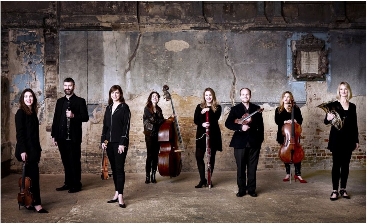
Ensemble 360

There will be ten concerts in all, culminating in a huge celebration on May 28th conducted by the Society's President, Sir Mark Elder, with eleven leading musicians from the Hallé Orchestra.