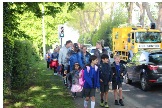
Braving the traffic on Middlewich Road (above & below)