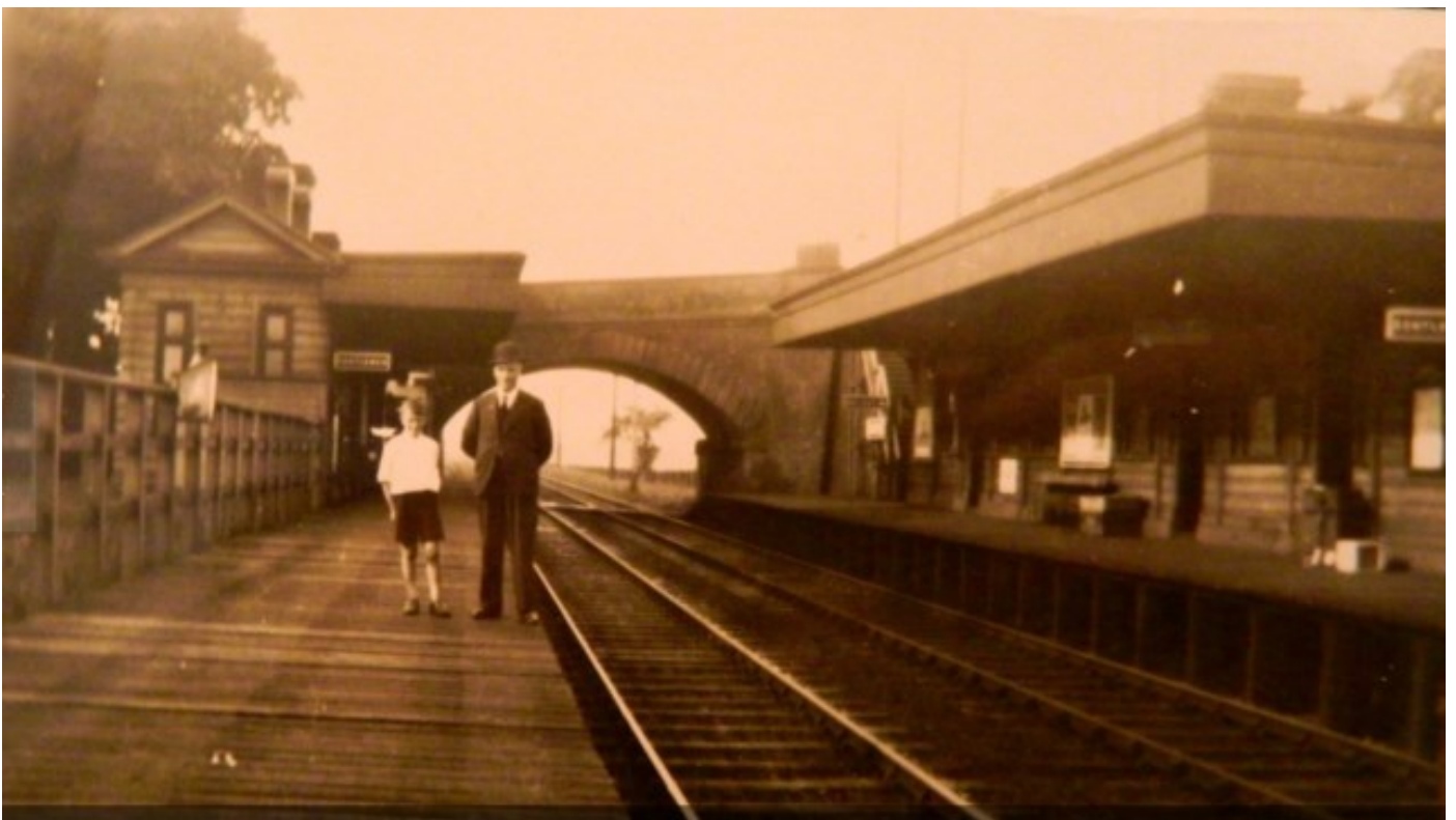
Goostrey station in the 1960s with a building on each platform