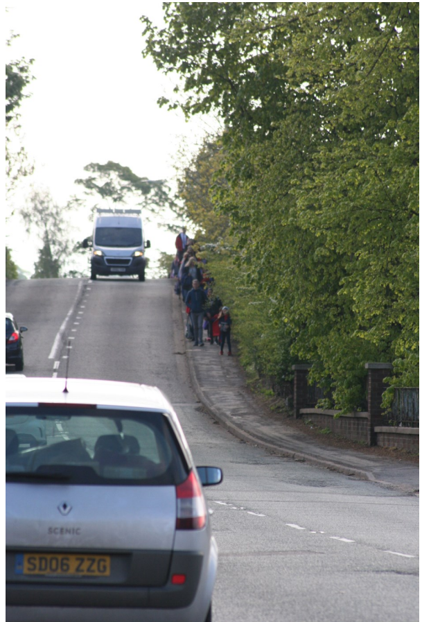
Approaching along Macclesfield Rd - the hedge is making the footpath even narrower on the one side