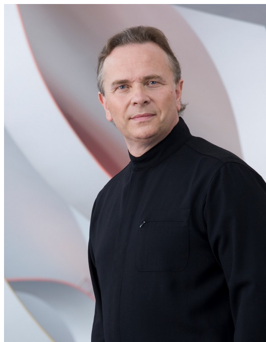
Sir Mark Elder