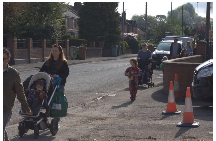
Especially if you have a buggy as well as a child!